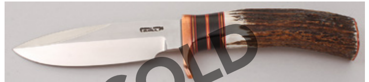
Randall Knives - Copper Combat Companion

Fixed Blade, Hidden Tang, 5" Blade, 440B Stainless, 55-56 Rc., Stag Handle, Copper Single Guard, Copper Butt Plate, 9 3/4" OAL, Pre-owned. Not used or carried. Like new, in original Randall packaging. Satin finish blade with thumb notches. Copper fittings with very nice stag handle. Copper, red fiber and black micarta spacers. Randall brown leather sheath with sharpening stone in pocket.