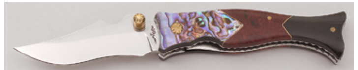
Suchat Jangtanong - Linerlock

Folder, 3" Blade, Stainless Steel, 3 Pc. Paua/Wood/Horn Scales, Brass Spacers, 4" Closed, Pre-owned. Not used or carried. Mirror polish blade with maker's early logo. Attractive handle configuratin includes shell, wood and buffalo horn. Stainless liners and backspacer have filework. Gold colored thumb stud.