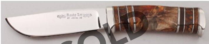
Randy Lee - Trailing Point Hunter

Fixed Blade, Hidden Tang, 4 1/4" Blade, CPM-154 Stainless, 59-60 Rc., California Buckeye Burl Handle, Nickel Silver Guard, Nickel Silver Pommel, 8 1/4" OAL, New from maker. Mirror polish blade with maker's logo on obverse. Buckeye burl/resin handle has layers of ironwood and pine cone resin layers on each end and includes seven layer stack with black fiber and nickel silver spacers. Tooled brown leather sheath from Sonja Lee. Ships in maker's zippered case.