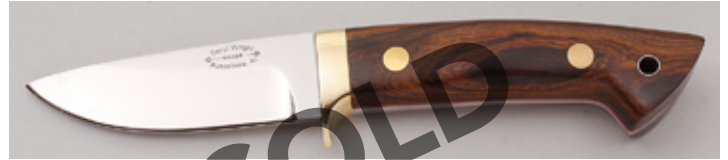
Deryl Wright - Classic Hunter

Fixed Blade, Tapered Tang, 3 5/8" Blade, CTS-XHP Carpenter Steel, 60.5 Rc. Cyro-Treat, Ironwood Handle Scales, Brass Guard, Thong Hole, Red Liners, 8 1/4" OAL, New from maker. Mirror polish blade with maker's logo on obverse. Brass hardware. Very nice ironwood scales with lots of grain. Brown leather sheath from the maker.