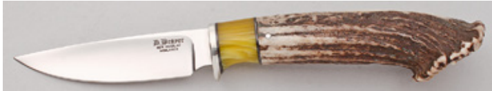
Devon "Butch" Beaver - Hunter

Fixed Blade, Hidden Tang, 3 7/8" Blade, 154CM Stainless, Stag Crown Handle, Nickel Silver Guard, 9" OAL, Pre-owned. Not used or carried. Made in 1989. Mirror polish blade with maker's logo on obverse. Nice stag crown handle with 3/4" amber spacer along with black fiber and stainless spacers. Two-tone brown leather sheath with oak leaf tooling. Ships in zippered case.