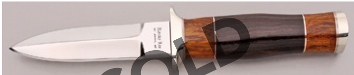
Randy Lee - Short Dagger

Fixed Blade, Hidden Tang, 3 1/2" Blade, 440C Stainless, 54-56 Rc., Blackwood Handle, Nickel Silver Hilt, Nickel Silver Butt, 7 1/4" OAL, New from the maker. High mirror polish blade finish. Double-edged. Maker's log on obverse ricasso. Blackwood handle has ironwood layers on each wend with red fiber and nickel silver spacers. Hand tooled brown leather sheath by Sonja Lee.