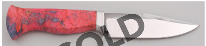
Ryan Lewis Forged True Smithing - Fighter

Fixed Blade, Hidden Tang, 5" Blade, 1095 Carbon Steel, 62-63 Rc., Pink Dyed Maple Burl Handle, Stainless Guard, 10" OAL, New from maker. Mirror polish blade with maker's logo on reverse side. Stablized maple handle. Custom blue dyed leather sheath with pink stitching and light tooling. Includes a certificate of authenticity.