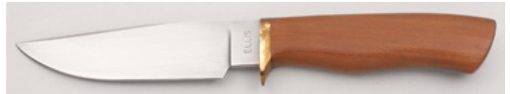
David Ellis - Hunter

Fixed Blade, Contoured Handle, Hidden Tang, 5 1/4" Blade, Carbon Steel, Walnut Handle, Brass Single Guard, 10" OAL, Pre-owned. Not used or carried. Hand-rubbed satin finish blade with maker's name on obverse ricasso and "JS" designation on reverse. Some discoloration on the brass guard. Nicely grained wood handle. Leather pouch style sheath from Schrap.