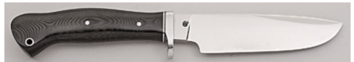
Sean McWilliams - Panama Fighter

Fixed Blade, Hidden Tang, 5 1/2" Blade, Stainless Steel, Black Micarta Handle, Stainless Guard, Thong Hole, 10 3/4" OAL, Pre-owned. Not used or carried. Mirror polish blade has miniscule scratch on obverse side near edge and maker's logo on reverse side. Polished single guard. Black fiber and stainless spacers. Black leather pouch style sheath. Includes a 2015 Blade Magazine with article about the maker.