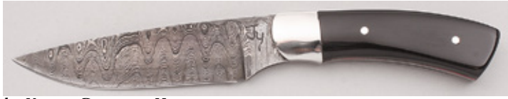
John Young - Damascus Hunter

Fixed Blade, Full Tang, 4 3/4" Blade, Damascus Steel, Buffalo Horn Handle Scales, Stainless Bolsters, Red Liners, 8 1/2" OAL, Pre-owned. Not used or carried. Damascus comprised of 1080/15N20/L6 steels forged by the maker. Maker's initials on ricasso. Polished bolsters. Dark buffalo horn scales. Brown tooled leather sheath from the maker. Ships in zippered case.