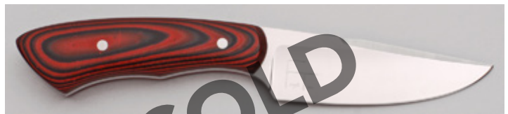
Ryan Lewis Forged True Smithing - FT Talon

Fixed Blade, Full Tang, 4 1/4" Blade, Nitro-V Steel, 61-62 Rc., Black & Red G-10 Handle Scales, 8 1/2" OAL, New from maker. Mirror polish blade with maker's logo on reverse side. Colorful handle. Custom brown leather sheath with light tooling is from the maker.