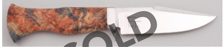
Ryan Lewis Forged True Smithing - Gentleman's Fighter

Fixed Blade, Hidden Tang, 5" Blade, 1095 Carbon Steel, 62-63 Rc., Dyed Maple Burl Handle, Stainless Guard, 10 1/8" OAL, New from maker. Mirror polish blade with maker's mark on reverse side. False top edge. Sculpted stablized maple handle. Custom brown leather sheath with light tooling from the maker. Includes a certificate of authenticity.