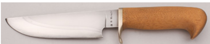
Michael H Manabe - Hunter

Fixed Blade, Hidden Tang, 6" Blade, Carbon Steel, Exotic Blonde Wood Handle, Nickel Silver Guard, 10 1/2" OAL, Pre-owned. Not used or carried. Hand-rubbed satin finish blade with double temper lines. Maker's name on obverse ricasso. Single guard. Wood could possibly be Honduran Mahogany. Brown leather sheath by Schrap.