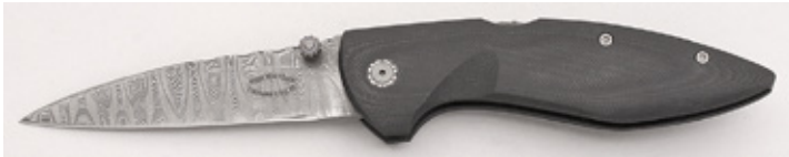
Tom Watson - Damascus Lockback

Folders do not include a pouch unless so indicated.