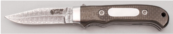
Robert Young - NY Special Flipper

Folders do not include a pouch unless so indicated.