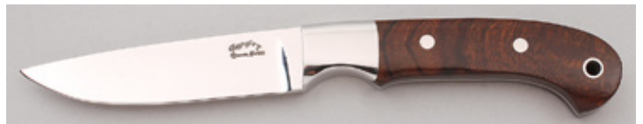
Gary Langley - Hunter

Fixed Blade, Tapered Tang, 3 3/4" Blade, CPM-154 Stainless, Desert Ironwood Handle Scales, Stainless Guard, Thong Hole, 7 3/4" OAL, New from maker. Mirror polish blade with maker's mark on obverse. Nicely grained ironwood scales. Tooled brown leather pouch-style sheath from the maker. Ships in zippered case. Comes with Letter of Authenticity from the maker.