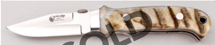
Robert Young - NY Special Linerlock

Folder, 3" Blade, Serial Number 554, CPM-154 Stainless, 62 Rc. Cyro Treat, Ram's Horn Handle Scales, Stainless Bolsters, Thong Hole, Stainless Liners, 4 1/8" Closed, New from maker. Mirror polish blade with thumb disc opening. Maker's logo on obverse. Integral stainless bolsters and liners. Ram's horn scales with black liners. Titanium stand-offs. Ships in zippered pouch.