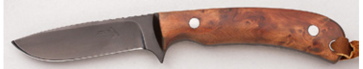
Keith Murr - Hunter

Fixed Blade, Full Tang, 3 3/8" Blade, A-2 Tool Steel, Thuya Wood Handle Scales, Thong Hole w/Lanyard, 8" OAL, New from maker. Blued A2 blade with maker's mark on obverse. Nicely figured and matched wood scales. Leather braided lanyard. Brown leather sheath from the maker.