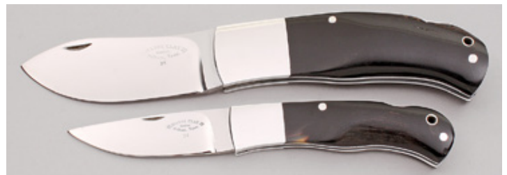
Wayne Clay - Ross Seyfried Hunter Set

Folder, 3 1/2" Skinner Blade, 3" Caping Blade, ATS-34 Stainless, Aluminum Frame w/ Buffalo Horn, Aluminum Bolsters, Thong Hole, Aluminum Liners, 5" & 4" Closed, Pre-owned. Not used or carried. Set was made in 1994 and was a collaboration between the maker and Ross Seyfried, professional guide and hunter & writer for Guns & Ammo. Set is serial number 38. Mirror polish blades with nail nick and maker's logo and serial number on obverse side. Natural buffalo horn handle scales. Each ship in a velvet pouch.