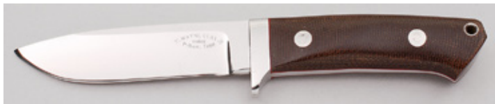
Wayne Clay - Loveless Drop Point Hunter

Fixed Blade, Full Tapered Tang, 4 3/8" Blade, ATS-34 Stainless, Green Micarta Handle Scales, Stainless Guard, Thong Hole, Red Liners, 8 5/8" OAL, Pre-owned. Not used or carried. Mirror polish finish on blade with maker's log on obverse side. Light storage mark on guard. Original brown leather sheath from maker. Ships in zippered case. Made in 2012.