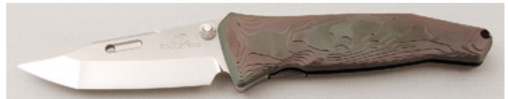
Rockstead Knives - SAI-T Japanese Custom

Folder, 3 1/4" Blade, ZDP-189 Stainless, 67 Rc., Coated Titanium Handle Scales, Thong Hole, Linerlock, 4 1/4" Closed, Pre-owned. Not used or carried. Mirror polish tanto "Honzukuri" blade (both sides have a convex grind). DLC Prism coated titanium handles scales have a terraced effect. Strong, solid linerlock. Black leather pouch. Individually serial numbered and comes with a certificate of authenticity. Ships in original wooden box with chamois cloth.