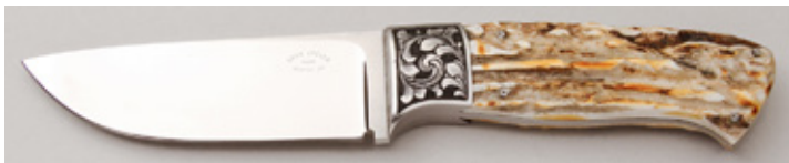
John Etzler - Engraved Hunter

Fixed Blade, Tapered Tang, 4 1/8" Blade, Unknown Steel, Stag Handle Scales, Stainless Bolsters, 8 1/2" OAL, Pre-owned. Not used or carried. Mirror polish blade with maker's logo on obverse side. Engraved bolsters are signed 'J. Flannery, Eng.'. There are slight scuff marks on the top of the bolster, very minimal. Nice stag scales. Tooled, brown leather sheath from L. Parsons, Mustang, OK. Ships in zippered case.