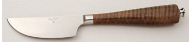
Tim Foster - Takedown Hunter

Fixed Blade, Narrow Tang, 3 3/4" Blade, Carbon Steel, Maple Wood Handle, Integral Hilt, Stainless Butt, 8 1/2" OAL, Pre-owned. Not used or carried. Satin finish blade with maker's name and "MS" Master Smith designation. Figured maple handle. No sheath.