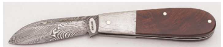
Rick Nowland - Damascus Slipjoint

Folder, 2 3/4" Blade, Damascus Steel, Integral Damascus Frame, Damascus Bolsters, Damascus Liners, 3 1/2" Closed, New from maker. Forged entirely by the maker. Blade and backspring is made of made of 1084/15N20 twist pattern. Bolster and liner are integral and made of 203 and mild steel. Figured desert ironwood scales. Comes with an open-top pocket pouch and ships in zippered case.