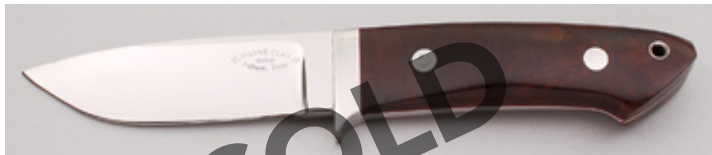
Wayne Clay - Loveless Drop Point Hunter

Folders do not include a pouch unless so indicated.