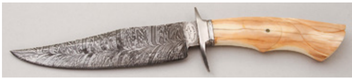
Joel A. Worley - Fighter

Fixed Blade, Hidden Tang, 6 3/16" Blade, Damascus Steel, Fossilized Walrus Ivory Handle, Stainless Guard, 11" OAL, Pre-owned. Not used or carried. Feather Damascus (1084 & 15N20) shows some dark spots (stored in sheath), with maker's mark on obverse ricasso. Stabilized, carved fossilized walrus ivory handle. There are a few scratch marks on the guard area closest to handle material. Hand-stitched brown leather sheath has an alligator inlay. CANNOT SHIP OUTSIDE U.S.A.